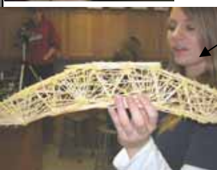
The bridge on the right was able to withstand the weight of three full pails of sand.