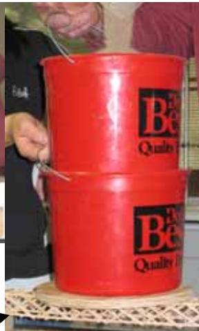
Two pails full!