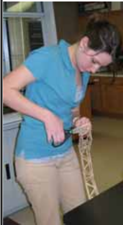
The bridge must fit in the space. Last minute adjustments...