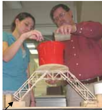
Please note the different bridge designs...